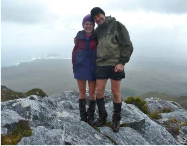
Lets her dear father take her on a 14 day bush walk in the Tasmanian SW